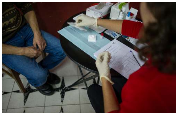
Outreach testing: "European HIV Testing Week" in Mouraria Harm Reduction Centre, Lisbon, Portugal.

female peer workers in order to encourage women to access harm reduction and treatment services. 19 Nevertheless, much more remains to be done to ensure that the services available for people who use drugs are tailored to women and are provided in a non-judgemental, non-discriminatory manner. 20 For instance, specific harm reduction and treatment services should exclusively target women, or those already available should have opening hours for women only, and should include childcare for women with children, incorporate sexual and reproductive health interventions, and provide social support for women and mothers. 21