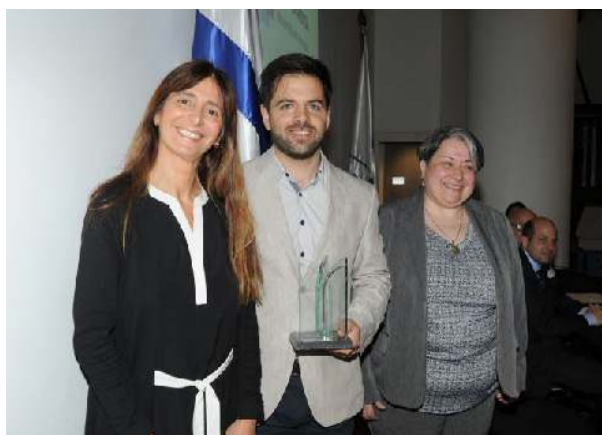
Uruguay's FBD project wins the First Prize for Transparency in Administration.

An evaluation of the social inclusion projects between 2011 and 2014 showed that, after 12 or 18 months, 50% of referees were employed – 72.7% of them in the formal economy. Regarding drug use, 66% were no longer using drugs, 24% used sporadically, and 10% reported that they consumed as much or more than before. 7