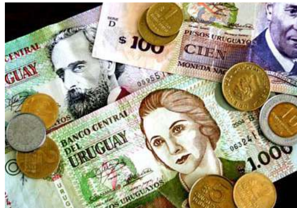
Uruguayan peso.